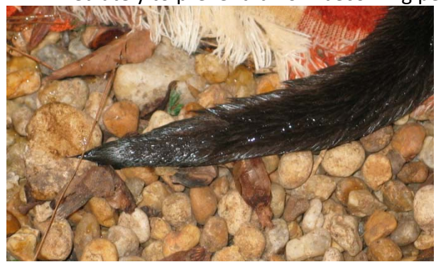
Tail tip after being self nursed on.