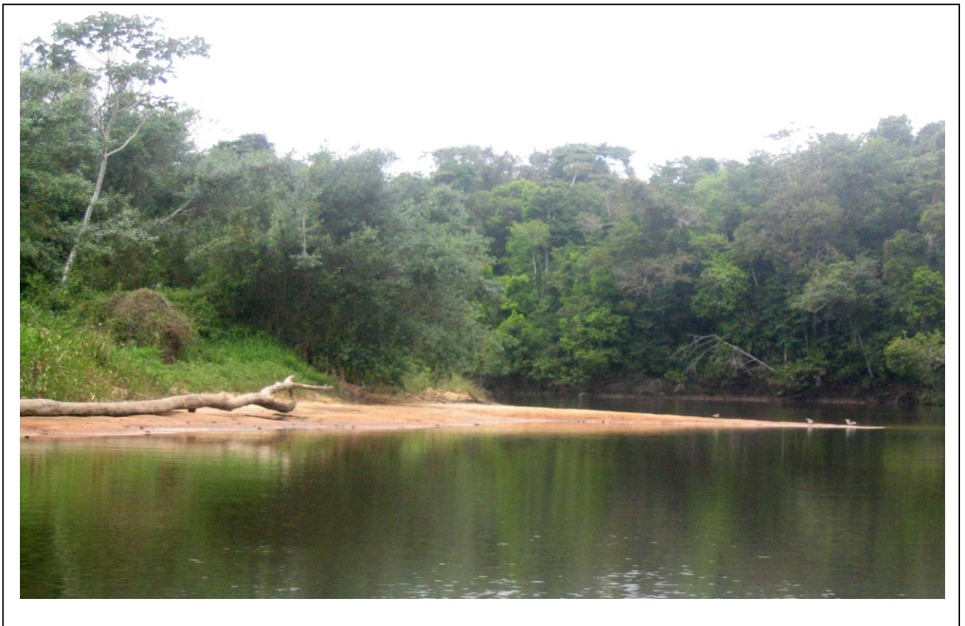
Giant Otter habitat in the Bolivian Amazon

Copyright 2011 by Zoo Dortmund. All rights reserved. No part of this publication may be reproduced in hard copy, machine-readable or other forms without advance written permission from Zoo Dortmund. Correctness of the data depends on the quality of data submitted by the holders to a high degree. The authors disclaim all liability for errors or omissions that may exist and shall not be liable for any incidental, consequential, or other damages (whether resulting from negligence or otherwise) including, without limitation, exemplary damages or lost profits arising out of or in connection with the use of this publication. Because the technical information provided in the studbook can easily be misread or misinterpreted unless properly analyzed, it is strongly recommend that users of this information consult with the Studbook Keeper in all matters related to data analysis and interpretation.