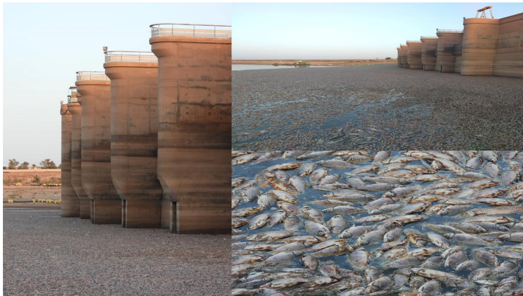
Figure 8. Situation of drought in lake Jorf Torba (15 th July 2022)

the dam is completely unusable (Fig. 8). Dams upstream on the Oued Guir and Oued Zouzfana, the source of Lake Jorf Torba, reduce water supply to Jorf Torba, and may threaten the existence of the Eurasian Otter and the lake's wetland ecosystem. Such dams include Kaddoussa dam, Douisse dam, Oued Zelmou dam and Kheng Alhalouf dam in Morocco.