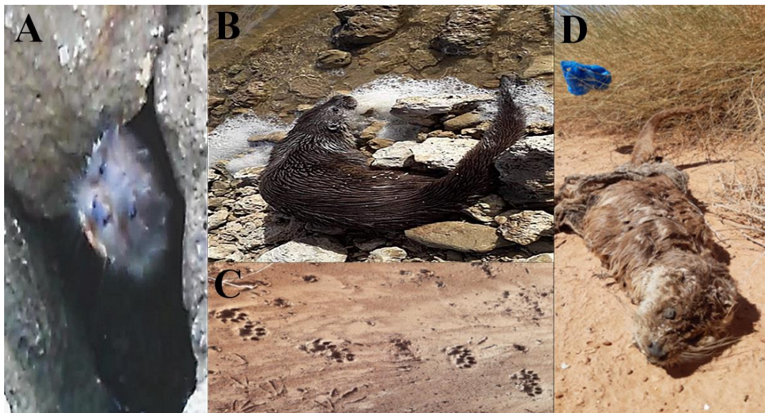
Figure 7. The otters in lake Jorf Torba; A) Otter in rock shelter (January 2021); B) Otter at lake shore 08 August 2021; C) Footprint of otters in Jorf Torba area; D) An otter found dead.

In addition to Lake Jorf Torba, the otter can be found in two other sites: The Abdala dam is 80 km and Igli (Oued zouzfana) is 150 km south of Bechar, where they have been reported by witnesses for years (pers. comm.). However, flooding is getting scarcer than usual. Droughts are becoming more frequent, and the level of the water in Lake Jorf Torba is seriously decreasing. On 15 July 2022, the authorities declared that