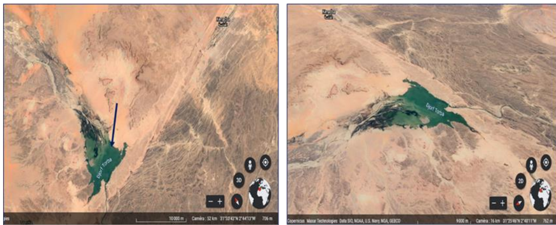
Figure 1. Aerial image of Jorf Torba Lake

The study was centered on a sector of the Jorf Torba Dam (reservoir) in the northwest of Algeria, 40 km west of Bechar: 31°25'46''N 2°40'11'' W (Fig. 1). Jorf Torba dam is an artificial lake that supports wetland fauna and flora (Fig. 2, 3). The dam receives its water mainly from Oued (=River) Guir; starting from the