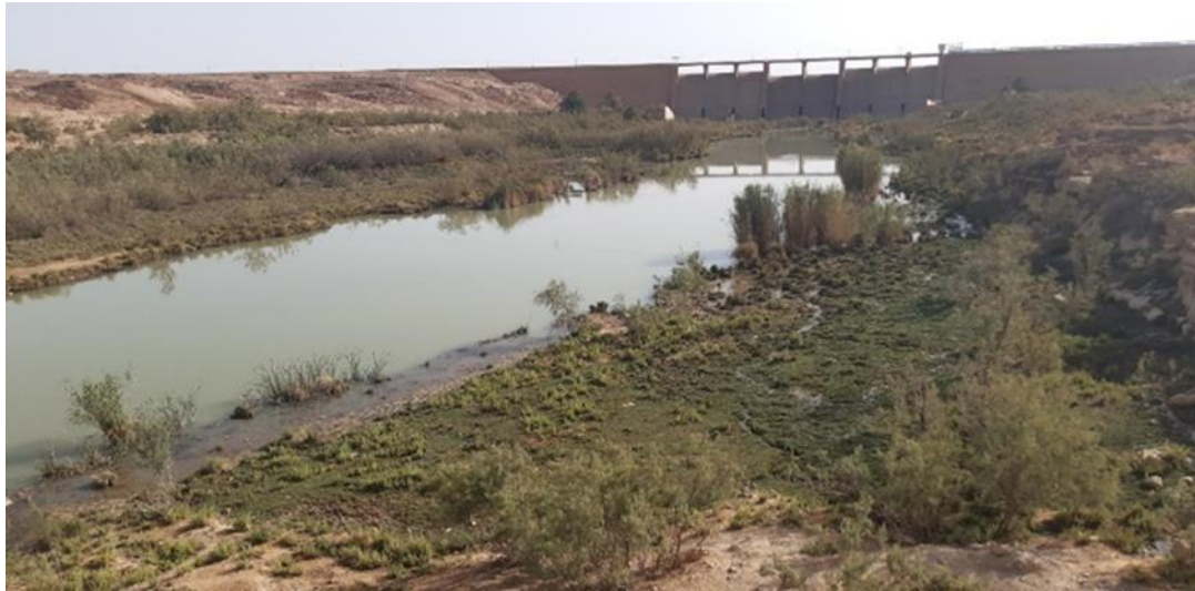
Figure 2. Jorf Torba dam

Moroccan Atlas, the Oued Guir runs for more than 600 km, passing through lake Jorf Toba, then joining the Oued Zouzfana north of Igli (south of province of Bechar around 250km from the Moroccan atlas), where together they form the Oued Saoura (Kabour et al., 2015). Lake Jorf Torba keeps ample water throughout the year. The Saharan zone is characterized by a high temperature which has a direct influence on the reservoir size. The heat period begins practically on the first of June, to extend until September (Coyne et Bellier, 1985). Temperatures are coolest between December and February. Annual rainfall at Jorf Torba was 9-49 mm (Mekkaoui, 2012), but it has decreased in the subsequent decade (Fig. 4).