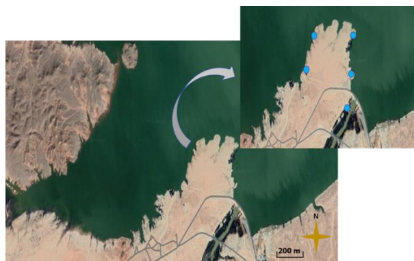
figure 5. Distribution of otters in Lake Jorf Torba (province Bechar): Blue points represent the occurrence of otters.

Combining records of footprints and observation of the animal, Lake Jorf Torba may hold about six otters (3 young otters were photographed, plus 1 male and 1 female and ± one more otter). Some otter activity is by night. All otters were close to the dam (Fig. 5), where the otter’s shelters were detected in rocky spaces (Fig. 6, 7), a refuge from the wind, cold, and heat. This observation corroborates other studies such as Kruuk (2006), which mentioned otters can use cavities as shelter.