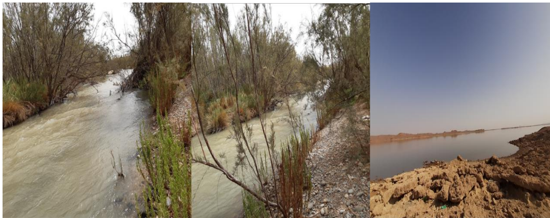
Figure 3. Riparian vegetation in Jorf-Torba area