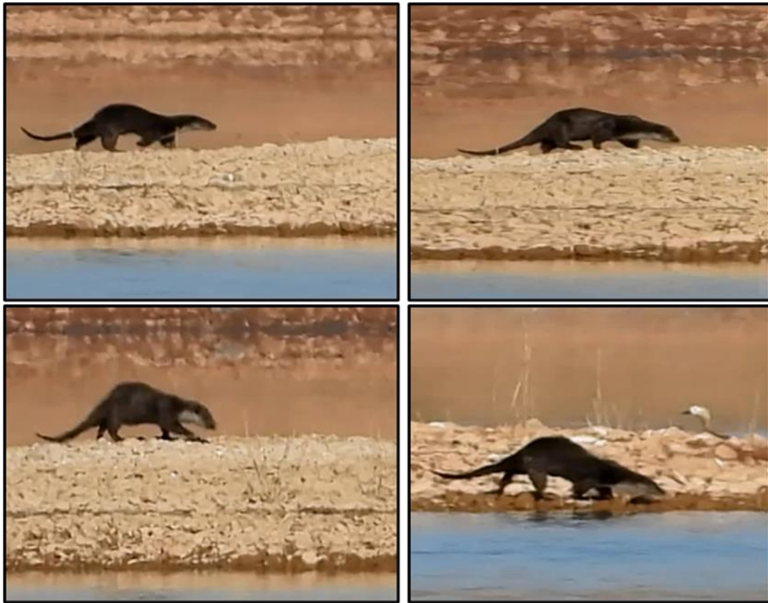
Figure 6. The Otter ( Lutra lutra ) in Lake Jorf Torba January 2021