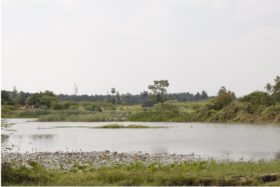
Figure 2. Typical habitat of L. perspicillata with natural vegetation