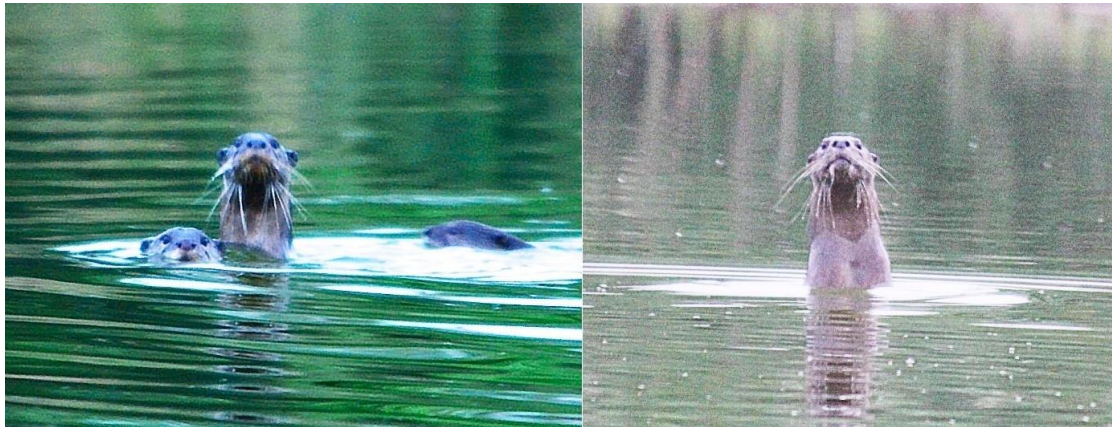
Figure 3. A group of Smooth-coated otter L. perspicillata