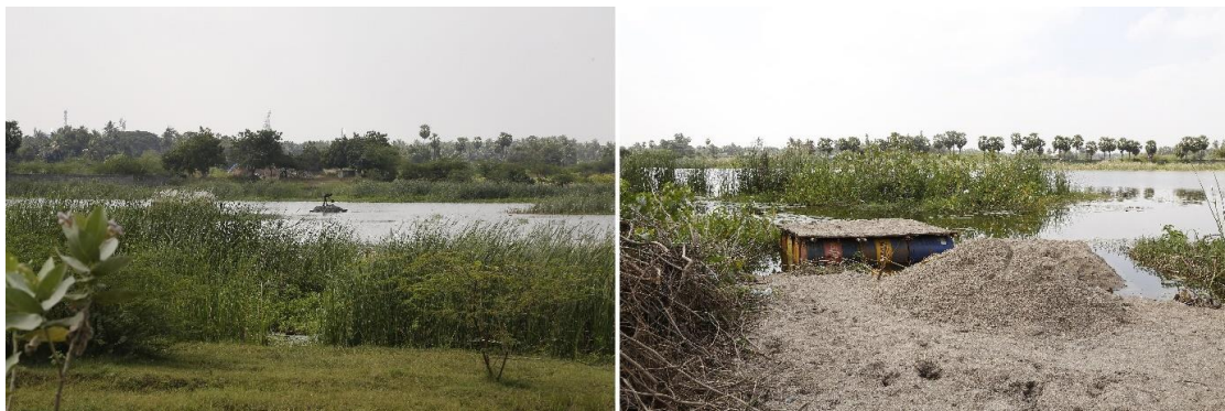
Figure 4. Sand mining along the bank of the river